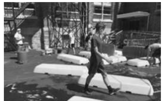
Youth Group washing the beds from the Women's Winter Shelter.